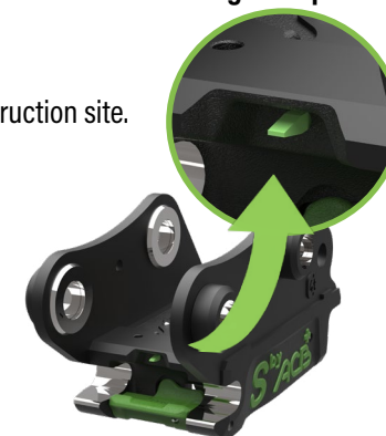
Good locking indicator

These features make S+ couplers a robust and secure solution, offering professionals in the industry an advanced and tailored solution to their most demanding needs.